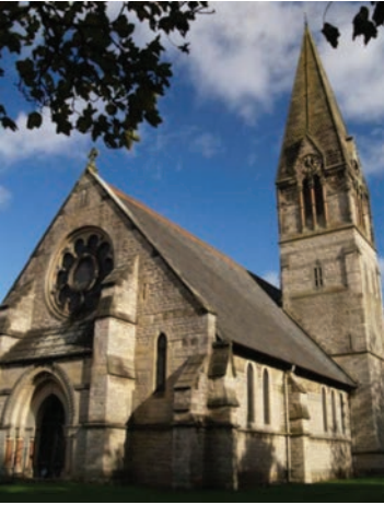
Appleton le Moors

On a lovely sunny day some 25 members visited three of the finest North Yorkshire moors churches. Our first visit was to St Gregory's church in Cropton, mentioned as far back as the 11th century and with reference to a chaplain in the 14th century. The church was rebuilt in 1844.